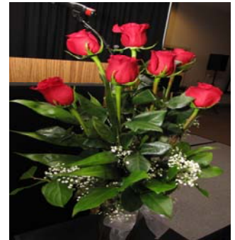
Roses for the known lives saved in 2009

This year was amazing! Due to the generous donations and pledges from the banquet, we raised over $62,000 for the year which is almost half of our annual budget. Praise the Lord!